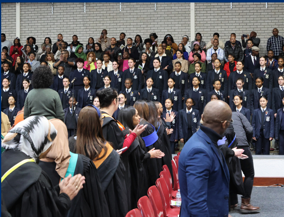
Our choir performing the national anthem.