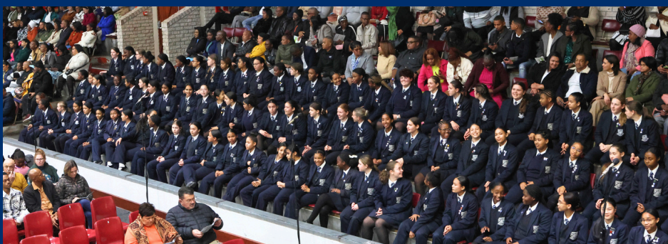
Our Rhenishers ready for their performance.